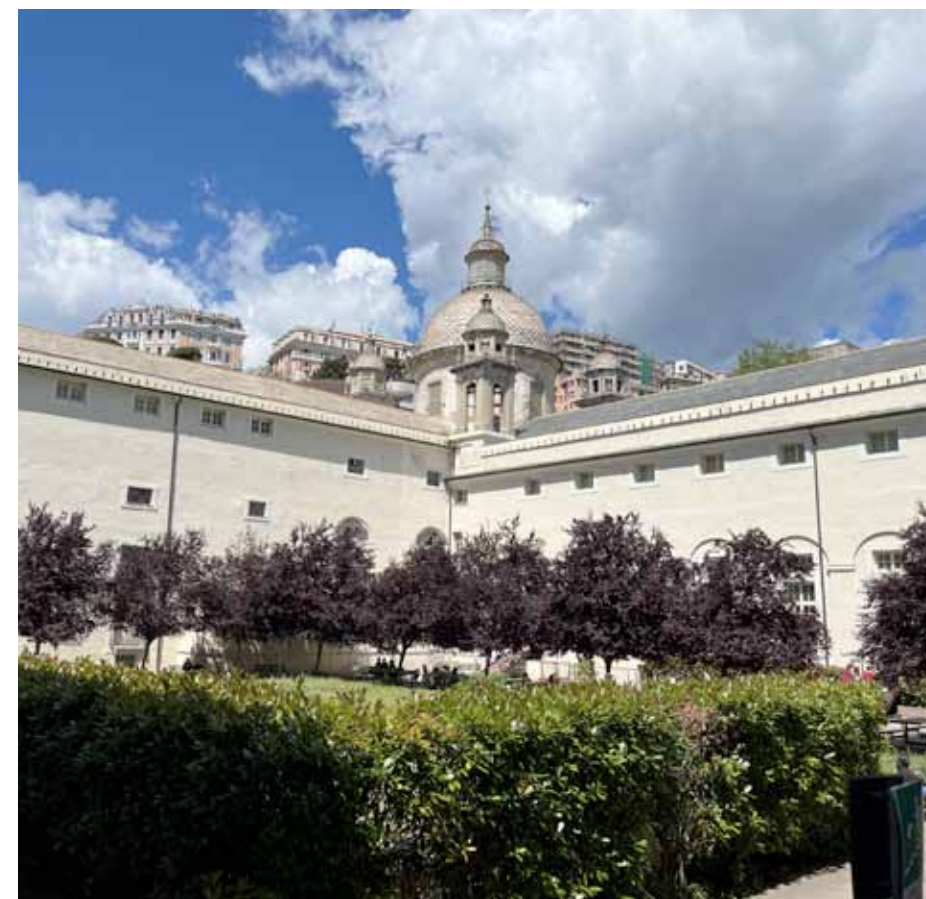
▲ Albergo dei Poveri