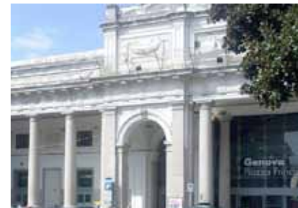
▲ Piazza Principe train station