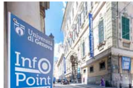
▲ Rectorate via Balbi 5