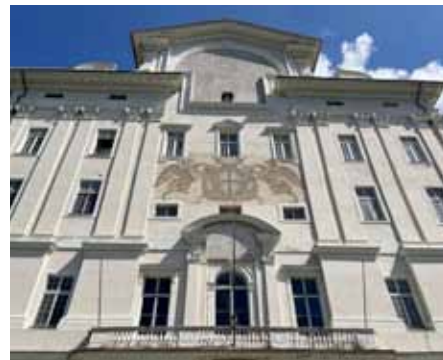
Albergo dei Poveri ▲

F rom Piazza Principe train station, walk along Via Balbi until you reach the Rectorate building at Via Balbi, 5. Enter the Rectorate building, take the first flight of stairs, and continue straight ahead. Before the internal staircase, on the left, there is a small corridor that leads to an elevator. Take the elevator to the third floor, where you will find Aula Mazzini. From there, follow the signs to the botanical garden, cross it, and you will then see the Albergo dei Poveri.