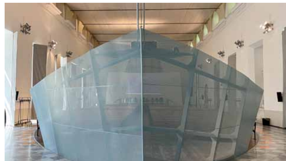
▲ Aula Magna